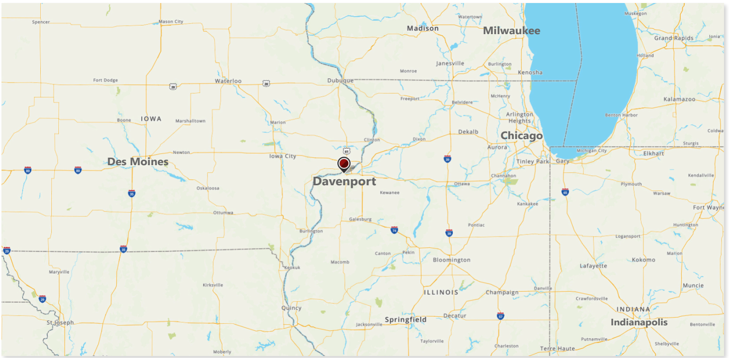
Figure 1: Location of Davenport, IA

due to federal relief programs and the post-World War II industrial boom.