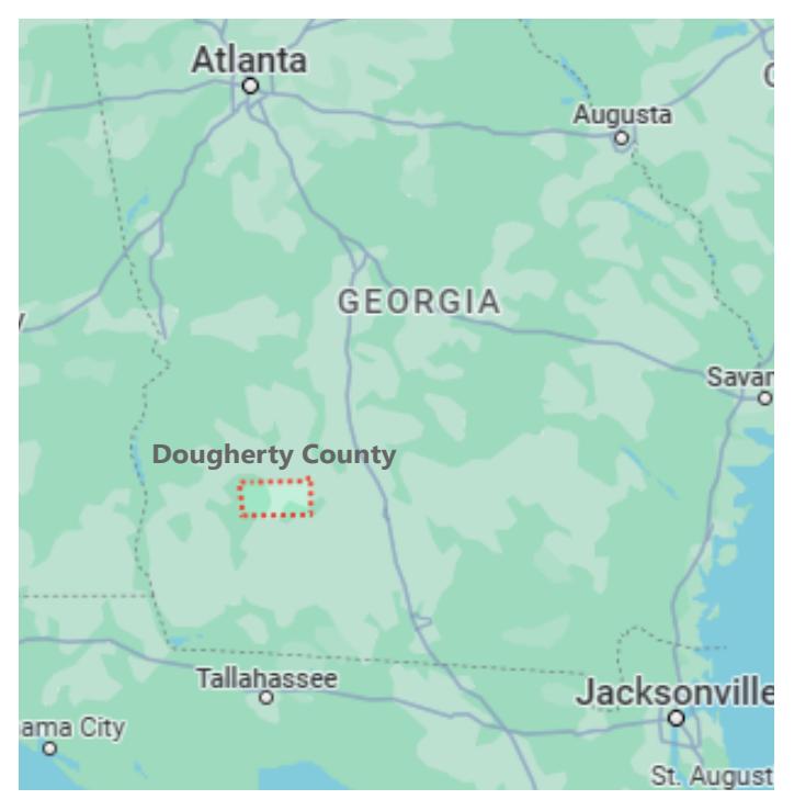
Figure 1: Location of the Dougherty County, GA

and these include the campuses of Georgia Institute of Technology, University of Georgia, and Georgia State University in Atlanta (200 miles north); Columbus State University (90 miles to the northwest); Auburn University (120 miles northwest); Florida State University in Tallahassee (90 miles south) and the University of Florida in Gainesville (190 miles southeast).