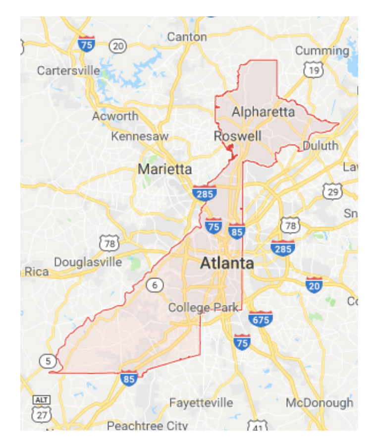
Figure 1: Location of Fulton County

Fulton County is a full service county and operates under the Commission-County Manager form of government. The Commission's Chair is elected at-large and six Commissioners are elected from geographic districts. All are elected to staggered four years terms with elections in November of even numbered years. Historically the Commission has been characterized by stability. The current Chair is in his fourth term, the Vice Chair is in his second term. The other three commissioners are in their first terms. Overall they represent a nice mix of experience and new energy. Some have characterized it as the best