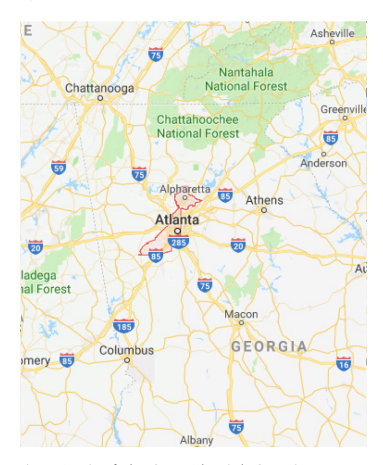
Figure 2: Location of Fulton County-Atlanta is the County Seat