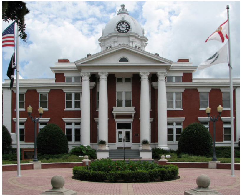
Pasco County Court House

But not to be missed are the smaller gems of Pasco. Located at the southern-most end of west Pasco, Holiday has the distinction of being home to some of the area's most beautiful Gulf Coast parks, including Anclote Gulf Park, Anclote River Park, and the newly opened Eagle Point Park. At the northwest corner of Pasco County, Hudson is home to the popular Robert J. Strickland Memorial Park (also known as Hudson Beach) and a great spot to charter a boat for fishing, diving, or just sight-seeing. Surrounded by more than 100 glimmering lakes, Land O' Lakes in