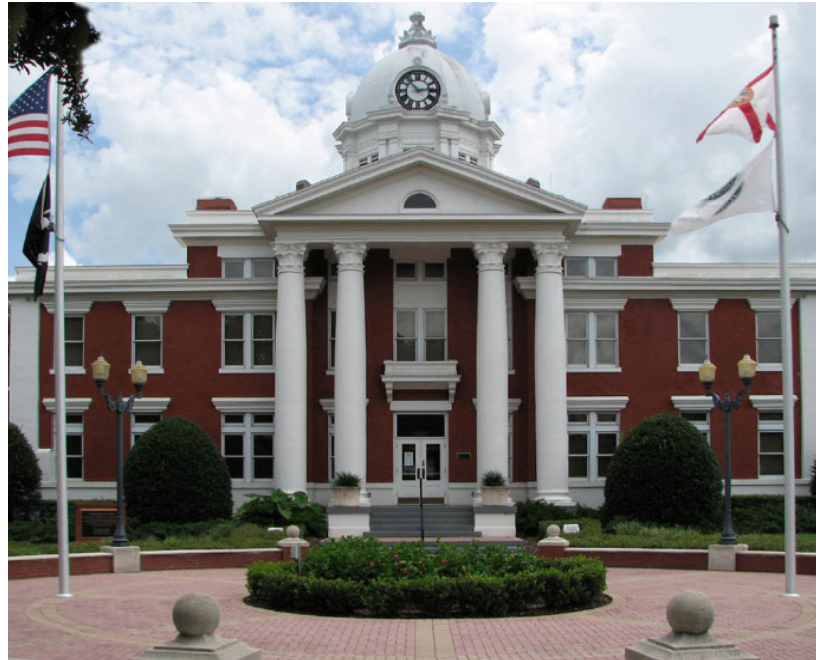
Pasco County Court House

But not to be missed are the smaller gems of Pasco. Located at the southern-most end of west Pasco, Holiday has the distinction of being home to some of the area's most beautiful Gulf Coast parks, including Anclote Gulf Park, Anclote River Park, and the newly opened Eagle Point Park. At the northwest corner of Pasco County, Hudson is home to the popular Robert J. Strickland Memorial Park (also known as Hudson Beach) and a great spot to charter a boat for fishing, diving, or just sight-seeing. Surrounded by more than 100 glimmering lakes, Land O' Lakes in