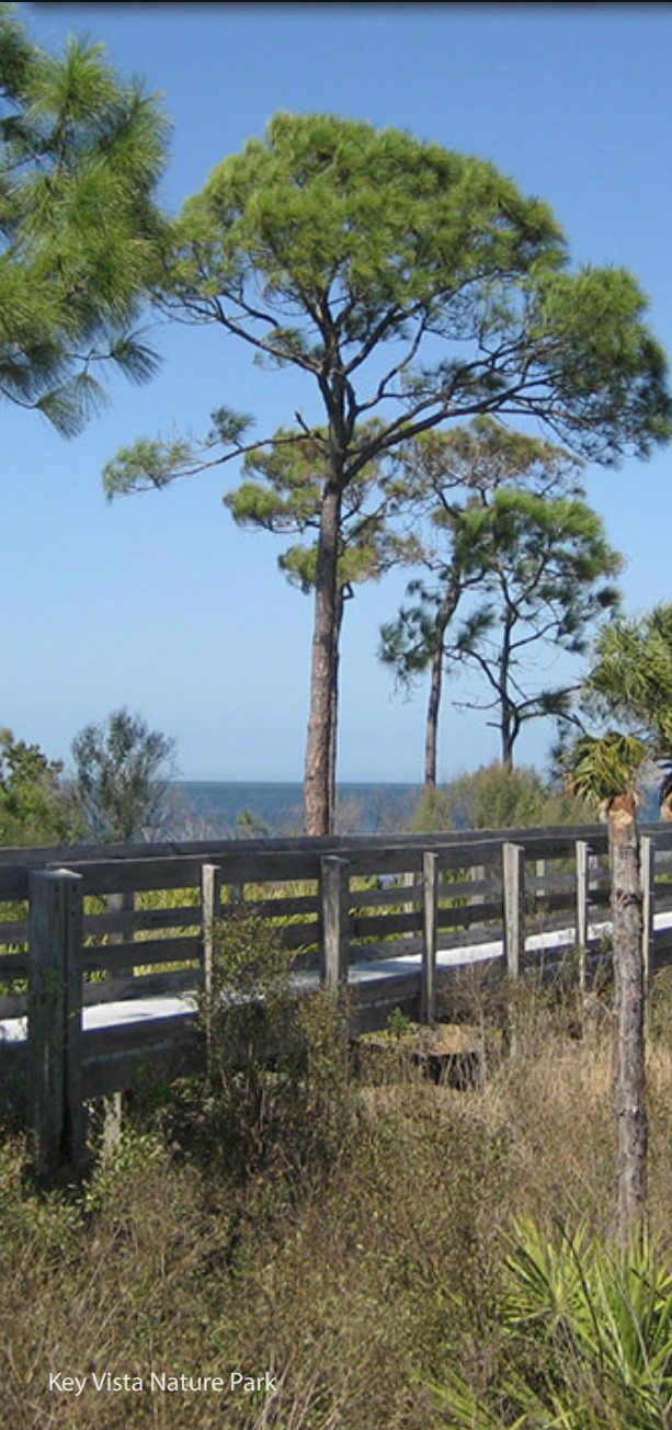
Key Vista Nature Park

Welcome to Pasco County! Located on the Gulf of Mexico, Pasco County was created by the Florida State Legislature on June 2, 1887 when Hernando County was divided into three parts, separating Citrus County to the north and Pasco County to the south. It is centrally located on Florida's West Coast, about 30 miles north of Tampa and 50 miles west of Orlando. This unique location places Pasco County within both a nine-county region referred to as the Nature Coast, as well as the four-county Tampa-St. Petersburg-Clearwater Metropolitan Statistical Area. The County contains a total area of 868 square miles, of which approximately 747 square miles are land and the balance is water area. Pasco County's 475,502 permanent residents make it the twelfth most populous county in Florida with a 2013 population density of 636.64 residents per square land mile.