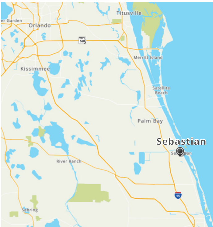
Figure I: Location of the City of Sebastian, FL

life, natural beauty and accessibility, it is perfect place to settle down and take in the fresh air. This coastal treasure's beautiful seas await you.